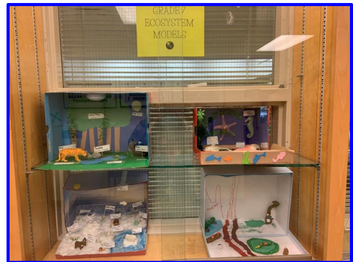
Grade 7 Ecosystem Dioramas